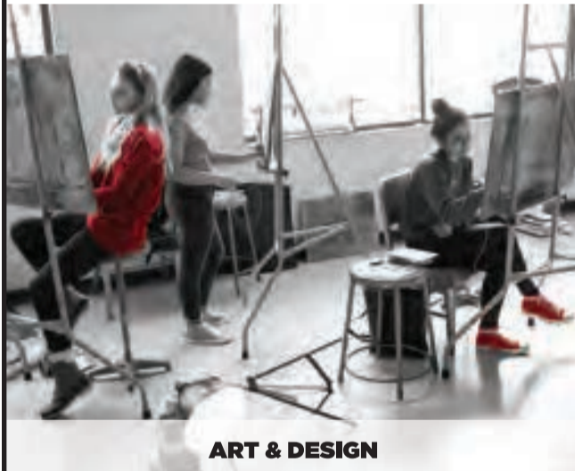
ART & DESIGN

COLLEGE OF FINE ARTS & COMMUNICATION LAMAR UNIVERSITY