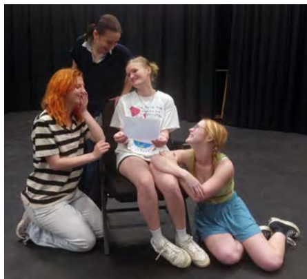
The cast of "Little Women" rehearse in the Studio Theatre.

their script came to life in rehearsal was the most rewarding part of the process.