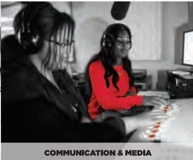
COMMUNICATION & MEDIA