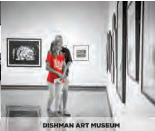
DISHMAN ART MUSEUM