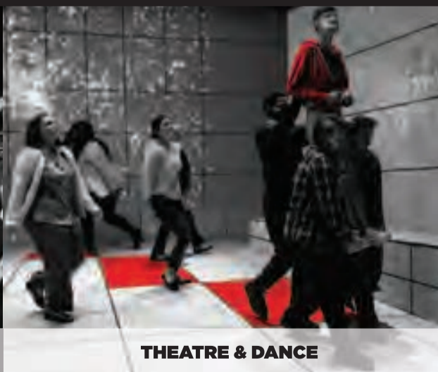
THEATRE & DANCE