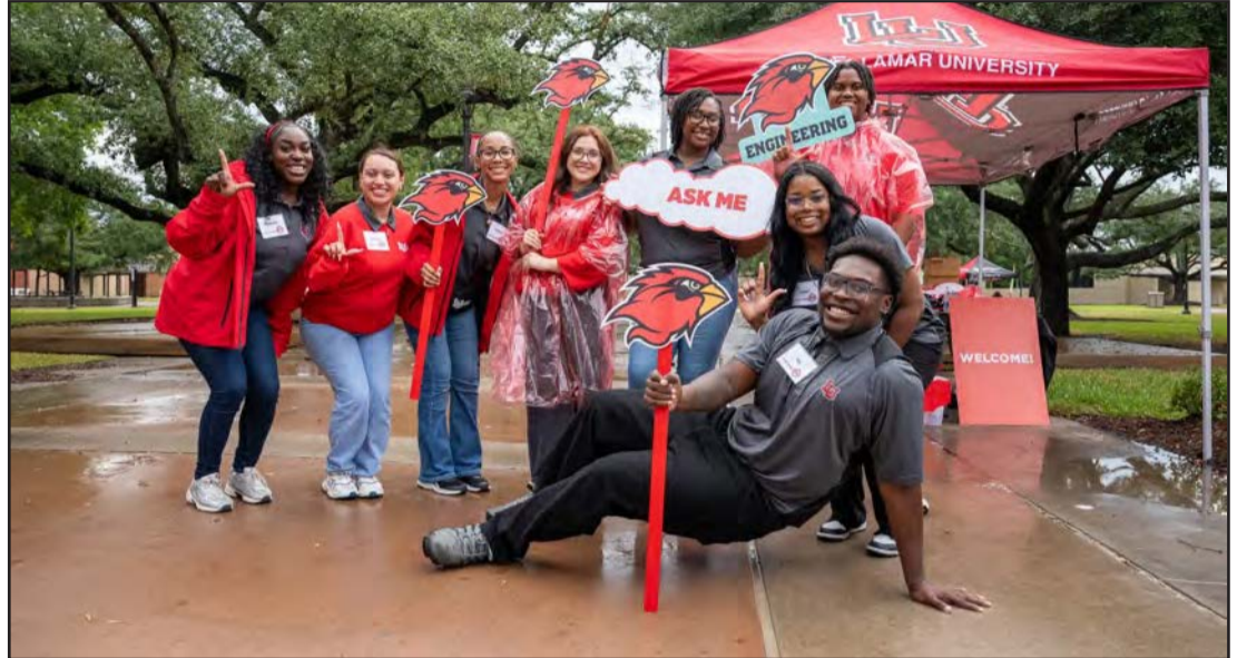
Recruiters will spread school spirit during the spring Cardinal View event.

Member of Texas Intercollegiate Press Association College Media Association