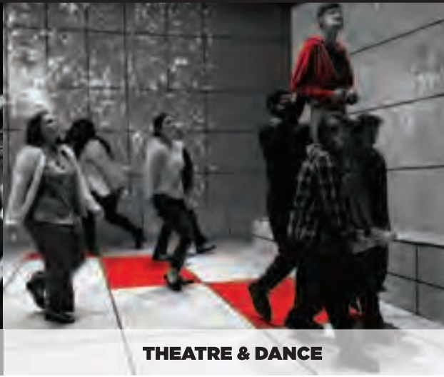
THEATRE & DANCE