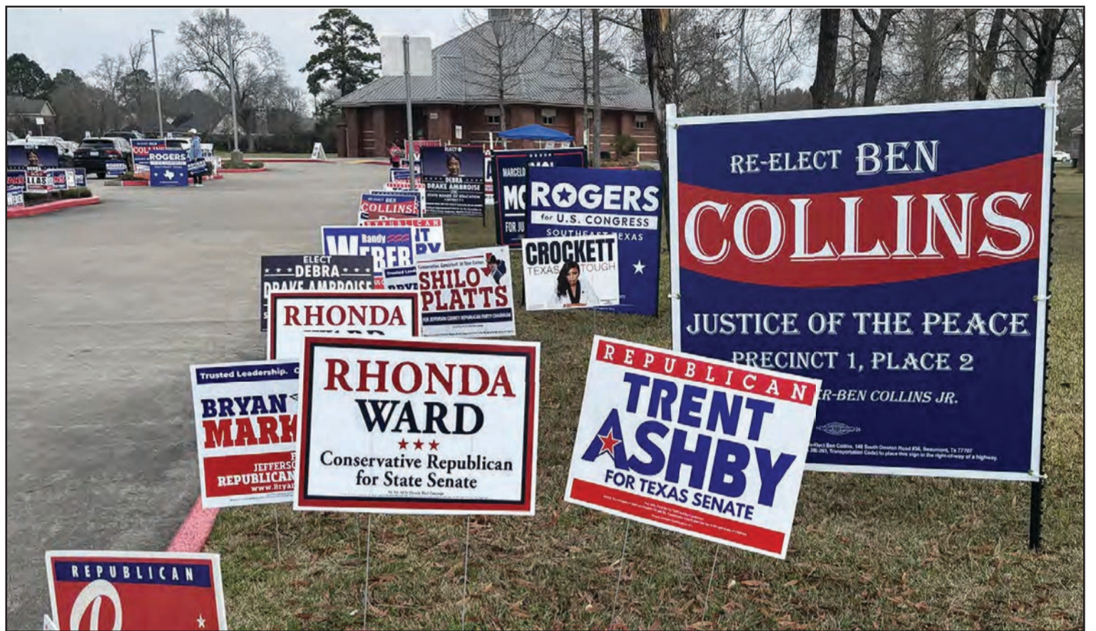
Election signs greet early voters at Rogers Park in Beaumont. Early voting runs through Feb. 27 with election day March 3.

The March ballot includes federal, statewide, judicial and local races. At the federal level, voters will select party nominees for one U.S. Senate seat